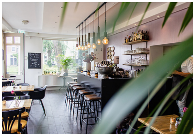
Restaurants & Cafes