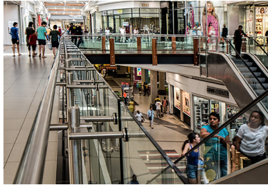
Shopping Centers & Shops