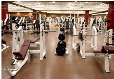
Gyms & Leisure Centres