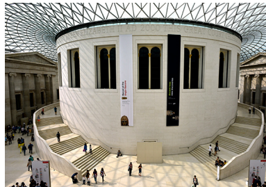
Museum & Galleries