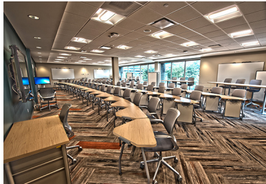
Universities, Colleges & Schools